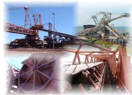
▶ Bulk Materials Handling Machines