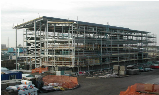
▶ Warrington Collegiate Business School