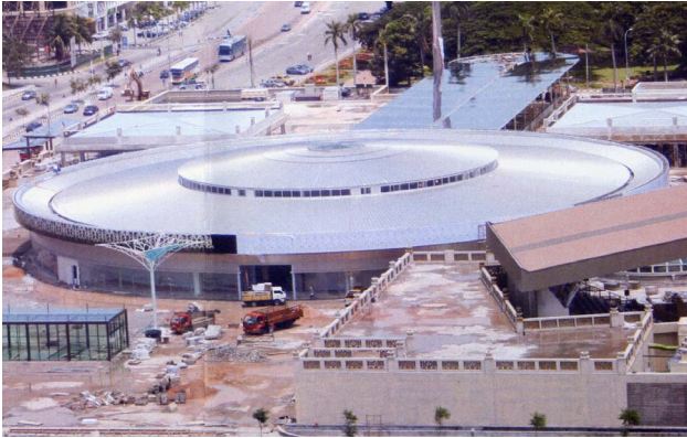
▶ Dome Project using S-Frame™